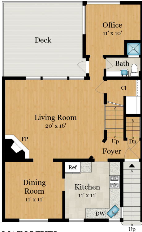
MAIN LEVEL 915 SQ FT