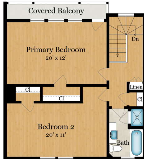
UPPER LEVEL 765 SQ FT